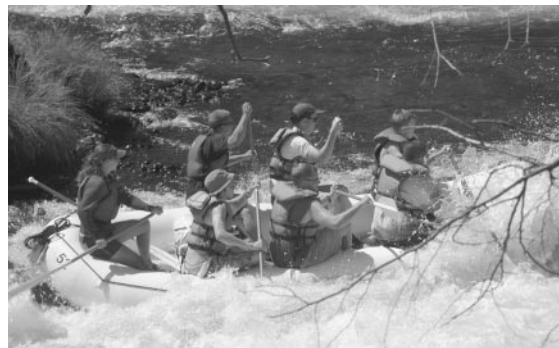
One of our rafts shooting the "gnarliest" rapid of the day!

On a day filled with sunny blue skies and temperatures over 100, sun-screen and swimming were major ingredients adding to a great river experience. In a combined effort of the Hemophilia Foundation of Oregon, Oregon Hemophilia Treatment Center, Bleeding Disorders Foundation of Washington, Puget Sound Blood Center, and Disabled Adventure Outfitters, through a financial grant from the NHF, the Youth Whitewater Rafting Adventure was a big success.