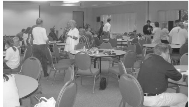
Attendees socialize in the main meeting room