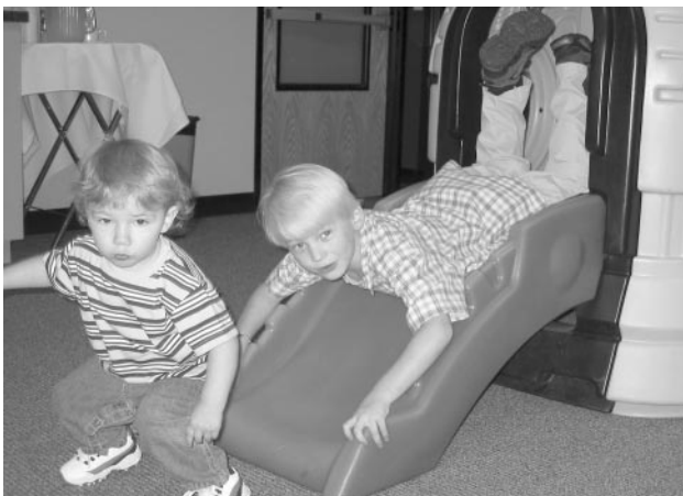
Kids enjoy the play equipment