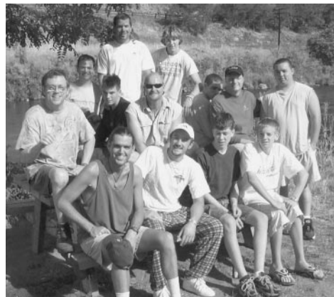
Rafters pose for a group picture

The rafting part of the trip was an exciting 16-mile stretch of popular whitewater, which was filled with a variety of churning, rolling rapids, mixed with calm, slow-moving sections perfect for swimming. The rapids were pretty big and fast, but the guides were experienced and the rafts were brand new, which made for a safe ride.