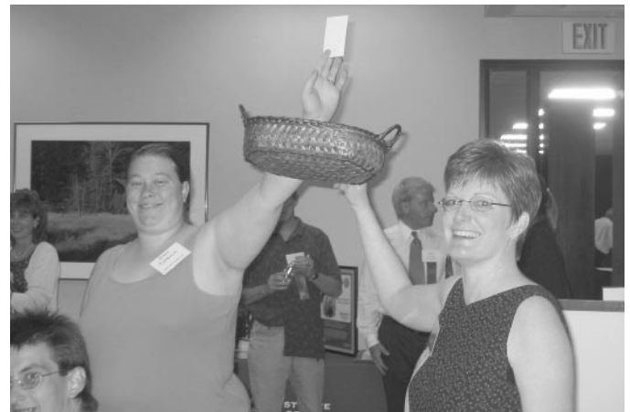
NHF raffle trip winners chosen